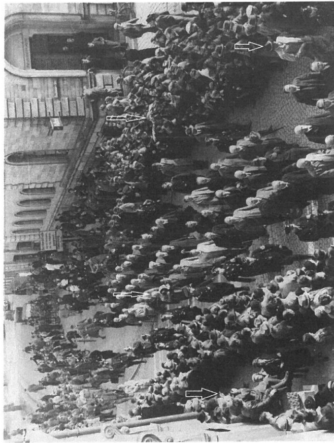
Figure 7.2. Photo by Josef Friedrich Coeppicus, Baden-Baden, 10 November 1938. (Stadtmuseum/-archiv Baden-Baden.)

One of the first photos of the series was taken from a balcony of the house opposite the precinct (fig. 7.2). Polizeihauptwache can be read over the main entrance. The picture shows the last of the Jewish men—men above middle age, well dressed, with ties and in winter coats, at least two even carrying an umbrella—walking in rows of three just after they had left the precinct. Two of them are still wearing hats; a third one is about to take his off. The men are closely surrounded by twelve SS and five police officers wearing their distinct black leather helmets. The SS apparently had just “reminded” the men of the order to walk bareheaded. On the right side of the column—between SS and the onlookers—there is a group of men with coats and hats. Since they obviously have an official function but do not wear uniforms, they are most probably Gestapo agents. Around them, the onlookers stand in two dense lines up to seven ranks deep, forming a corridor. While what