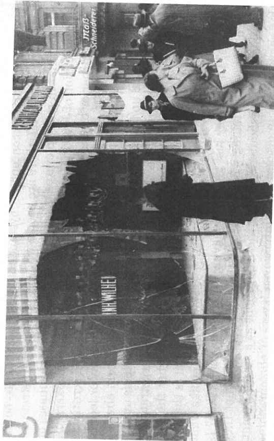
Figure 7.1. Photo by an unknown press photographer, 10 November 1938, New York Times , 11 November 1938. (AP Images/Hollandse Hoogte.)

The photo does not show the act of the destruction itself, the smashing of the windows and the looting of the shop. It only portrays shards,