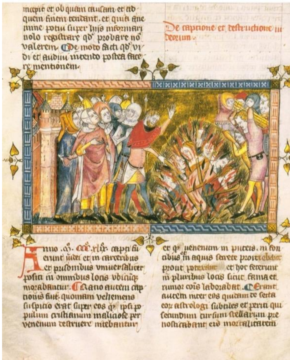
Figure 2 Medieval manuscript, Gilles Li Muisis, c. 1350 CE MS 13076-77, fol. 12v Bibliothèque Royale de Belgique.