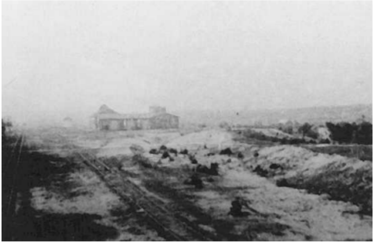
Site of the Belzec killing center