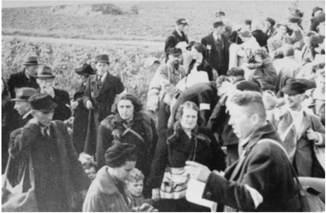
Transit camp in Netherlands, 1943.