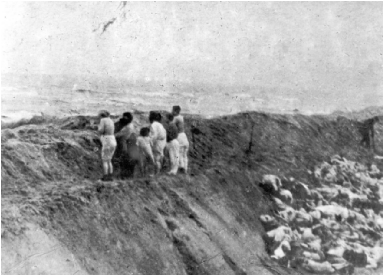
Skede Beach (Latvia), december 1941