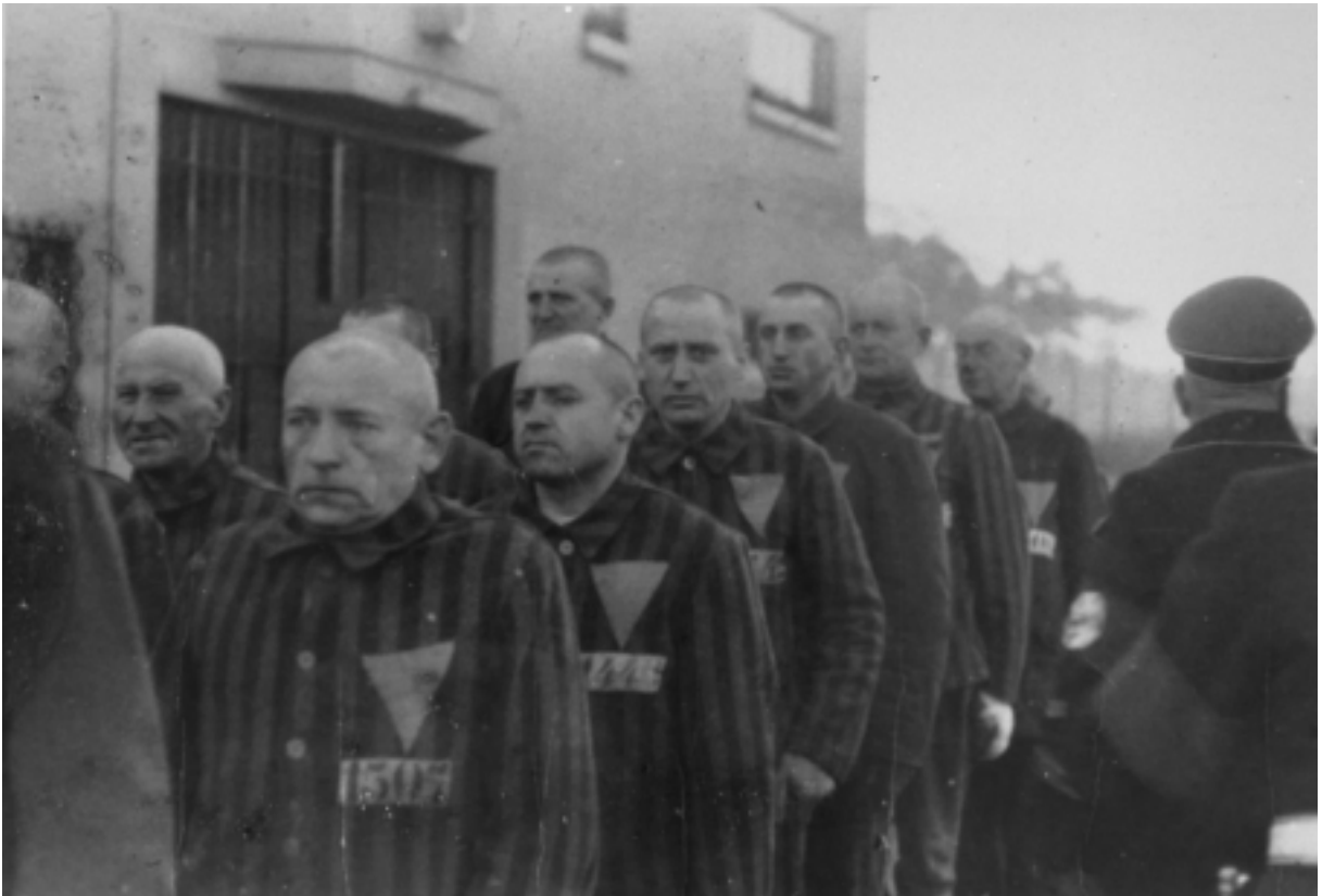
Prisoners in Sachsenhausen, 1938