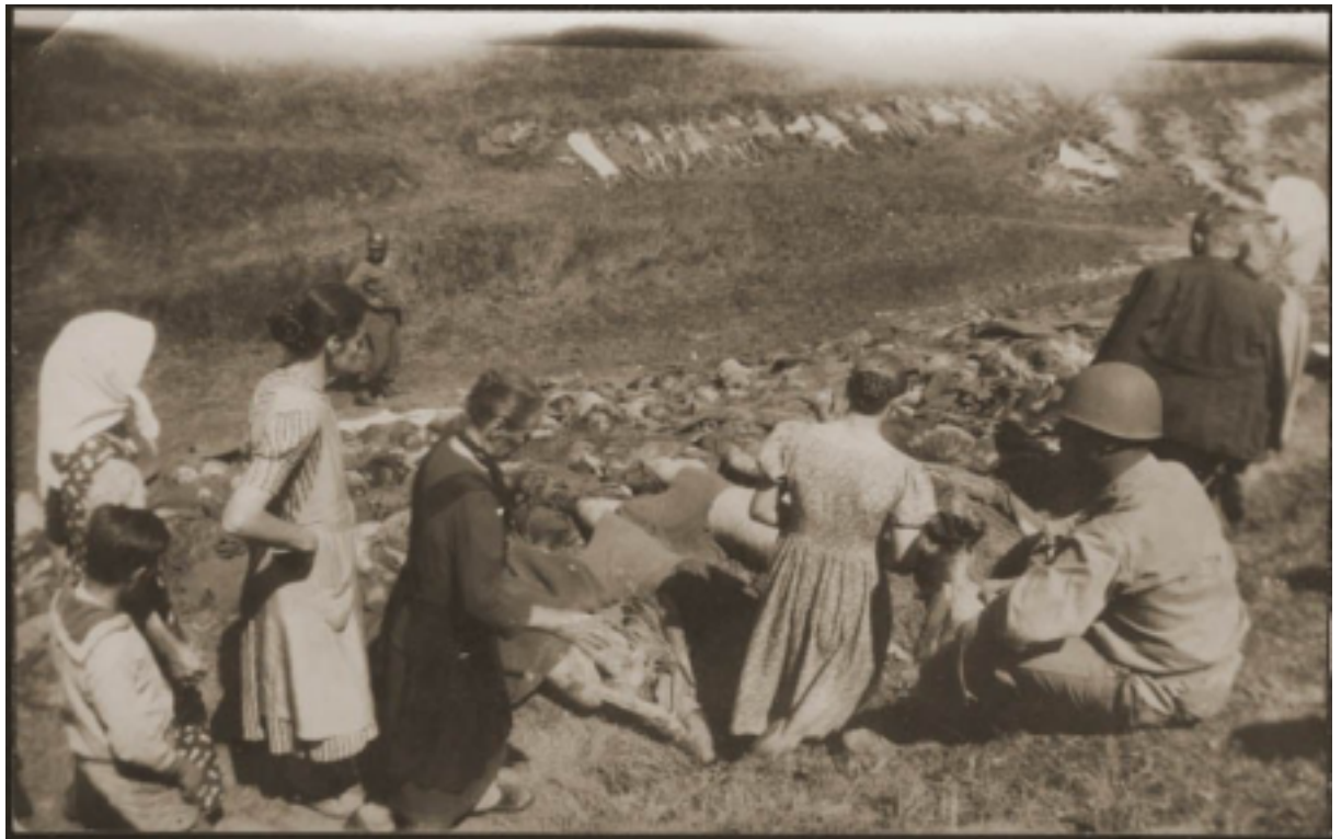
German civilians are forced to view bodies of victims of a death march African American soldiers of the US Army escort German civilians through a site where camp prisoners were massacred during a death march from Buchenwald. Such tours forced Germans to recognize the crimes committed by the SS. Near Nammering, Germany, 1945