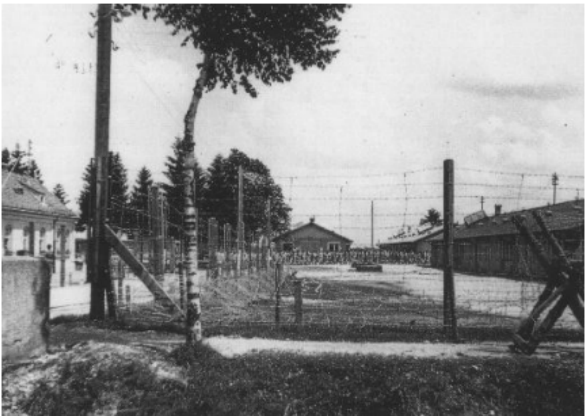
Early view of the Dachau concentration camp

An early view of the Dachau concentration camp. Columns of prisoners are visible behind the barbed wire. Dachau, Germany, May 24, 1933.